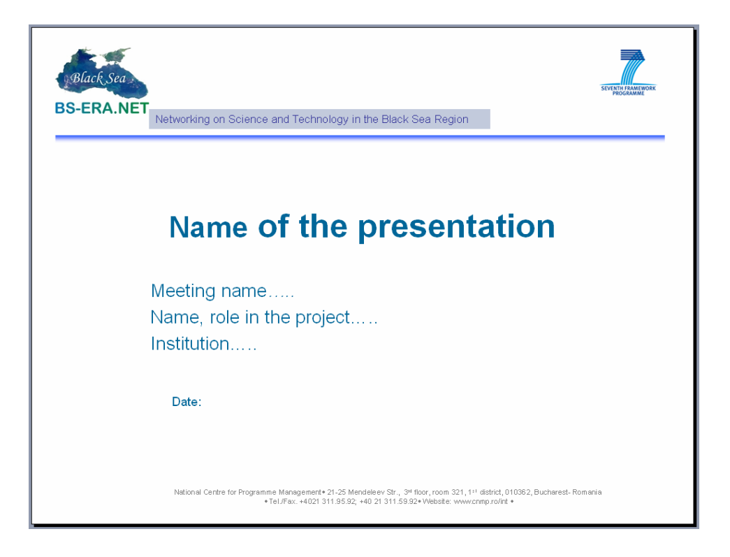
Fig. 3: BS-ERA.NET presentation

The presentation aims at attracting the interest of international organisations that are actively involved in the BS region, the governments, the industrial world and research & academic communities within the countries that participate in the project and contribute to ensuring the viability of BS-ERA.NET beyond the project's lifetime.