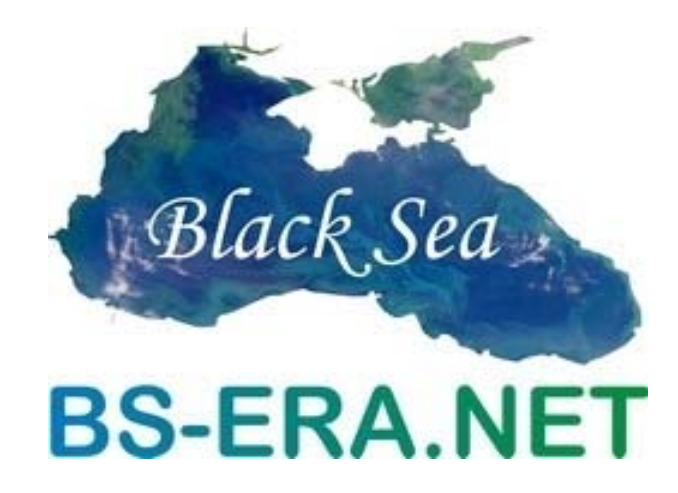
Fig. 1: BS-ERA.NET logo